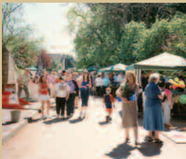
Church Gala Day

On the Sunday nearest to the saint's day, 17 June, the church celebrates the saint's life. Botolph was a gifted leader and helped many to find faith and serve God.