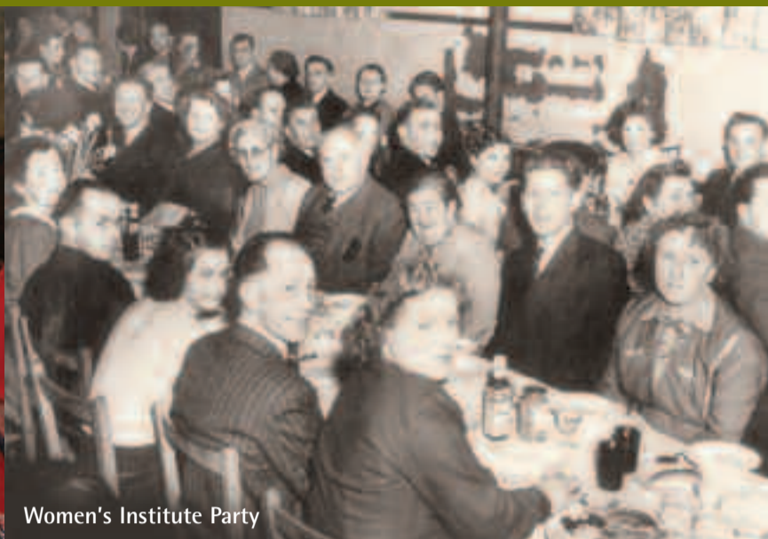
Women's Institute Party

St Botolph's church has been at the centre of village life for over a thousand years. Despite much change in the village and in society as a whole, St Botolph's retains that role today: contributing to village life and bringing people together regularly to celebrate in weekly worship, baptisms, weddings, funerals as well as the traditional festivals of the church.