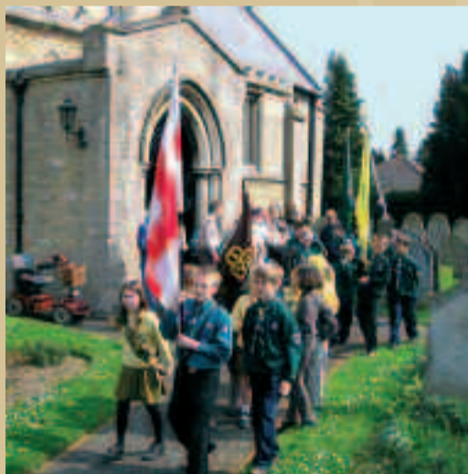
St George's Day

Church services are held every day during Holy Week. Easter Eve is marked with a bonfire, in a special grate. From this the Paschal candle is lit and taken into the darkened church to light candles for the congregation. Easter Day is the highlight of the church year, with music and flowers celebrating the resurrection of Jesus.