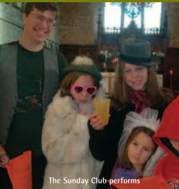
The Sunday Club performs