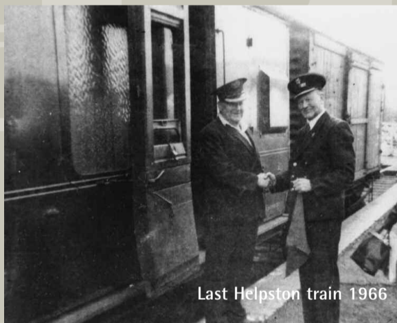
Last Helpston train 1966

Helpston was hardly on the front line in either of the World Wars, but many villagers served and died for their country. In the Second World War some of the very first bombs dropped on England fell between the station and Etton, where there was a dummy airfield. Later a stray German plane opened fire on the crossing.