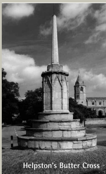
Helpston's Butter Cross