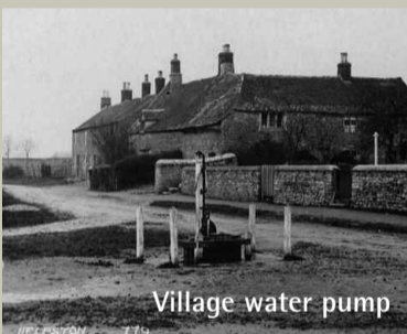
Village water pump

Perhaps the beginnings of modern Helpston can be traced to the early nineteenth century with the enclosure of the land and the opening of the road across to Glinton in 1813.