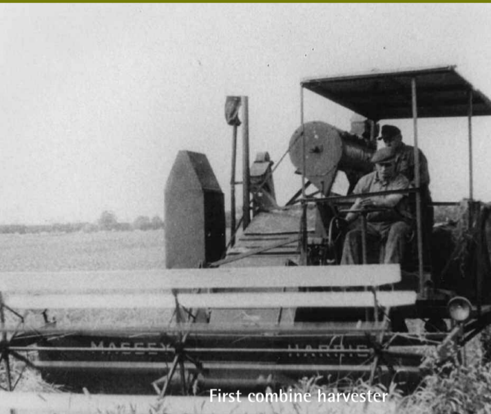
First combine harvester