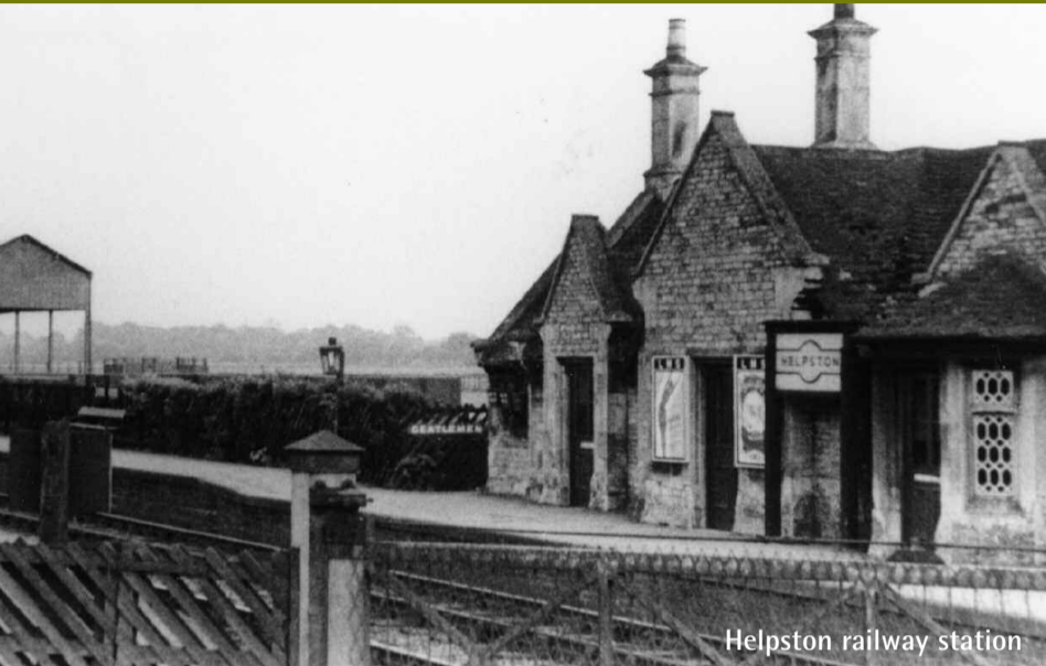
Helpston railway station