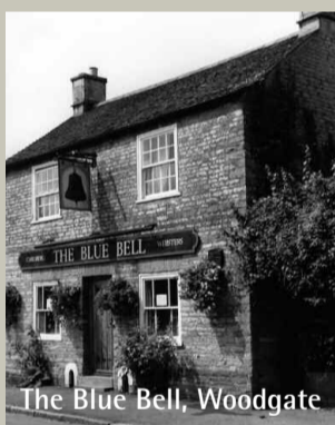
The Blue Bell, Woodgate

There were five beer houses and three public houses. Beer houses were restricted to the sale of beer, ale and porter, cider and perry. The five beer houses have all become private dwellings. Two public houses, the Bluebell and the Exeter Arms, remain.