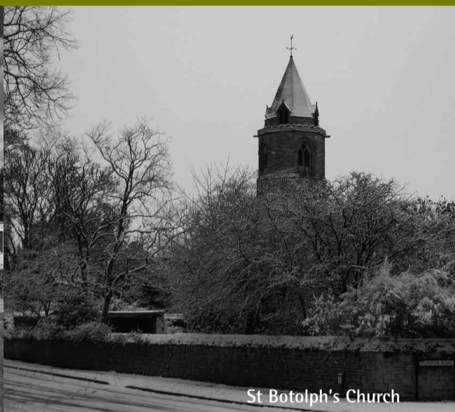
St Botolph's Church

The village of Helpston lies at a junction of two contrasting landscapes. To the east are the flat lands of the fens, formerly expanses of marsh and reed bed, now fertile farmland. To the west is gentle, rolling and often wooded countryside with pretty limestone villages.