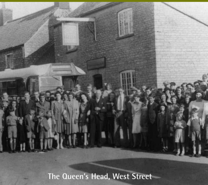
The Queen's Head, West Street